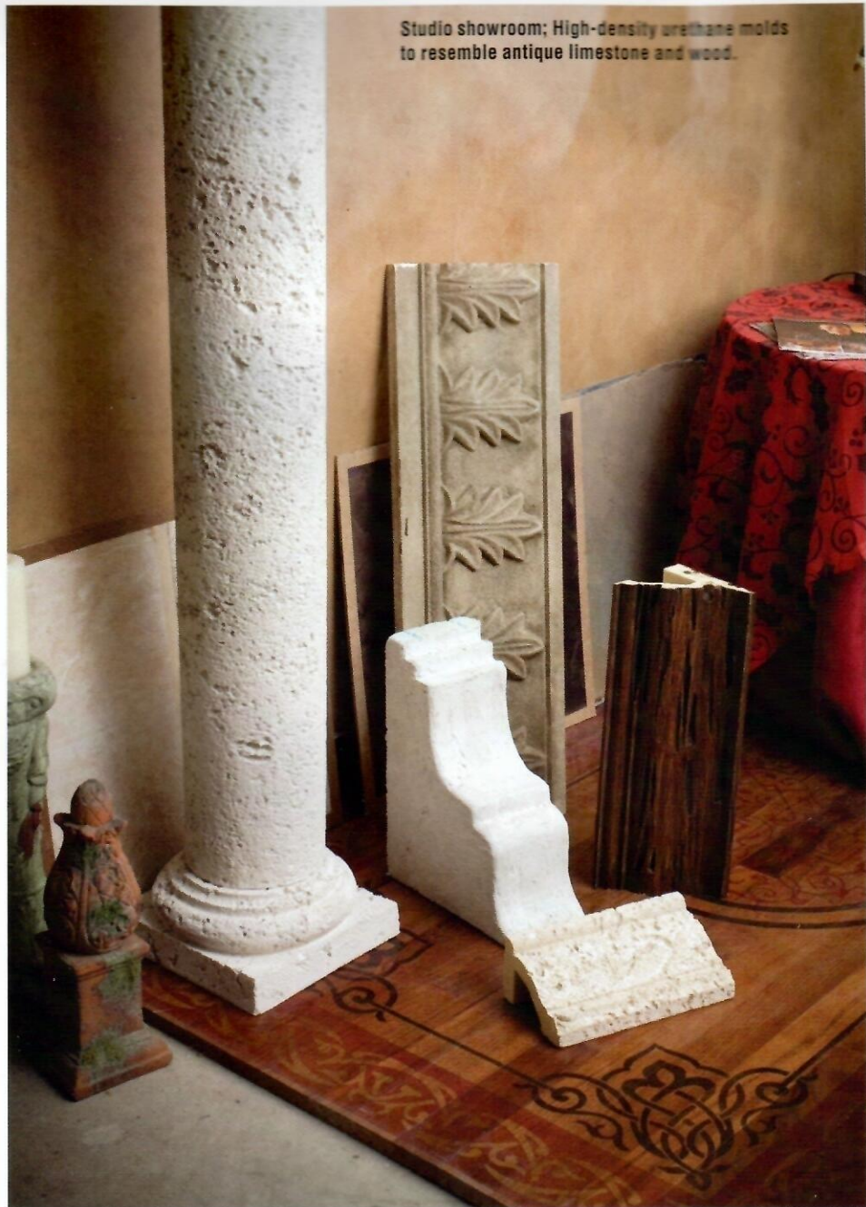
Studio showroom; High-density urethane molds to resemble antique limestone and wood.

Deco Illusions also does custom work with Dutch Made Inc. Adding unique finishes and decorative inlays to these already beautiful cabinets can create an original look made