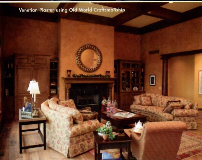
Venetian Plaster using Old World Craftsmanship