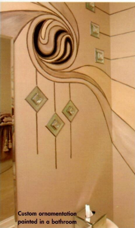
Custom ornamentation painted in a bathroom