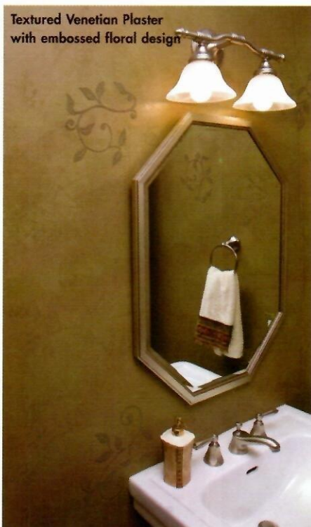
Textured Venetian Plaster with embossed floral design