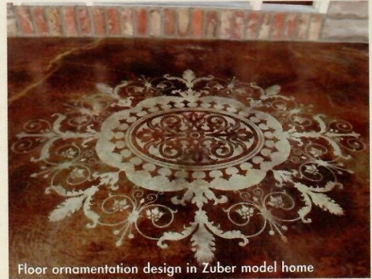
Floor ornamentation design in Zuber model home