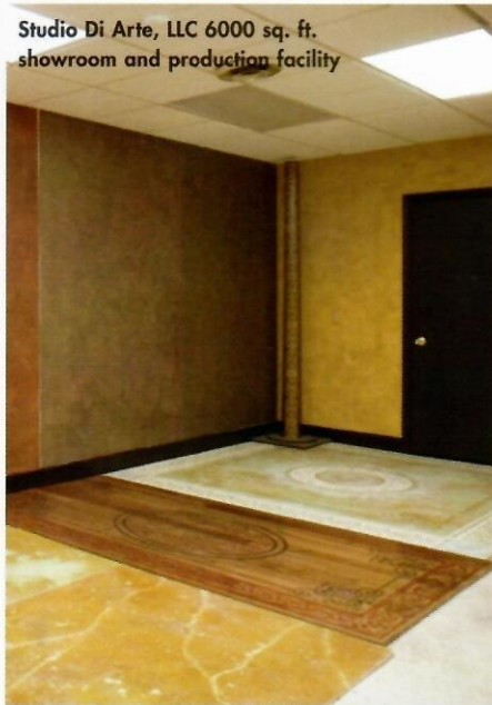
Studio Di Arte, LLC 6000 sq. ft. showroom and production facility