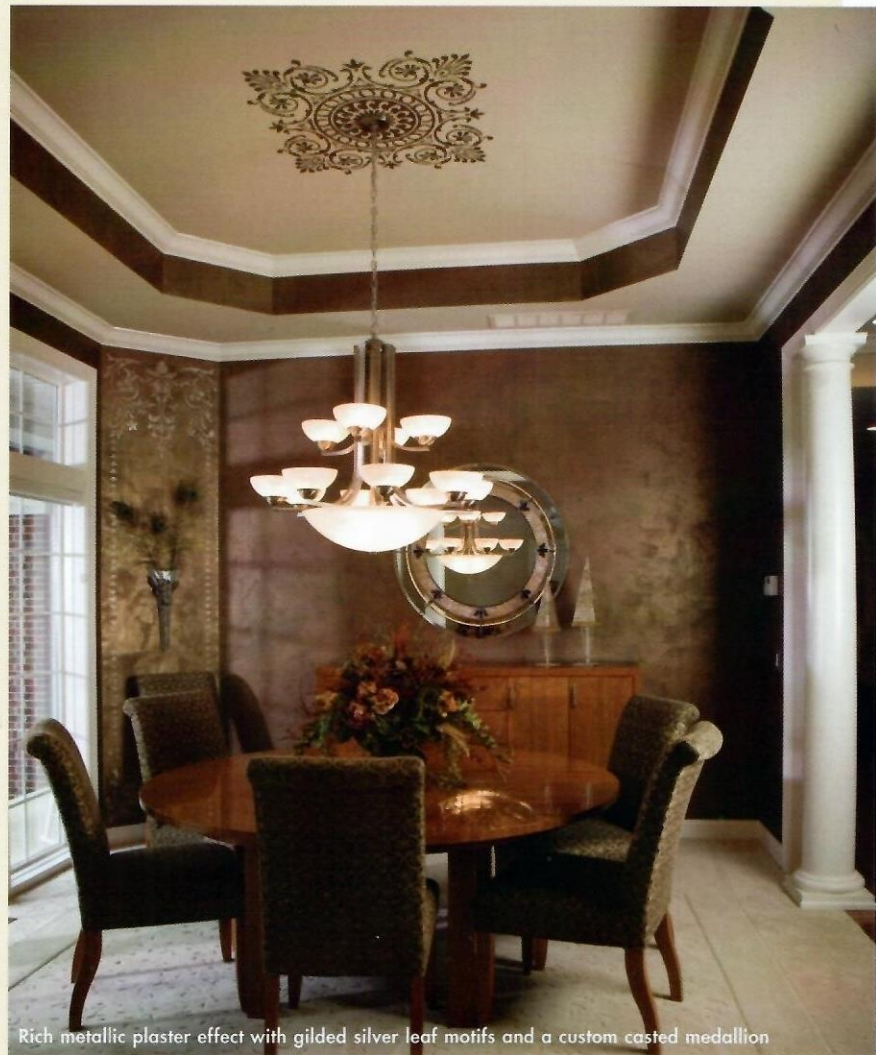
Rich metallic plaster effect with gilded silver leaf motifs and a custom casted medallion

The fledgling artist spent four years teaching him-