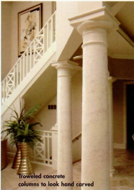
Troweled concrete columns to look hand carved